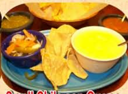
Small Chile con Queso