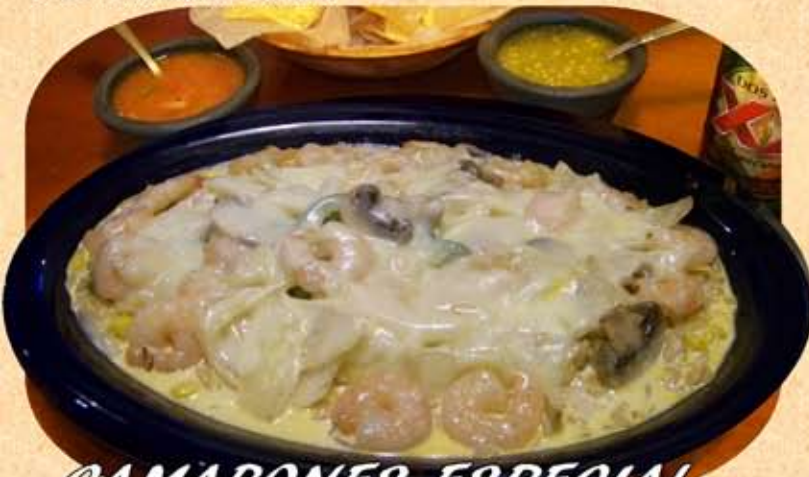
CAMARONES ESPECIALES.....$15.50 CAMARONES ESPECIALES.....$15.50 Fresh shrimp cooked in a special white cream sauce with Mushrooms, Bell Peppers, and Onions over a bed of Rice, topped with Monterrey Jack Cheese served with Guacamole, Pico de Gallo and Tortillas

*NOTICE; consuming raw or undercooked meats, poultry, seafood, or eggs may increase your risk of foodborne illness, especially if you have certain medical conditions